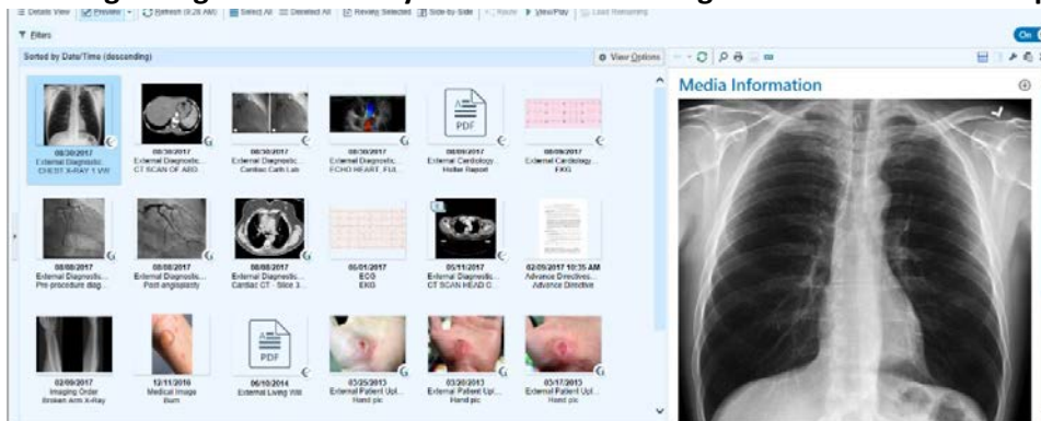
Image Exchange June 15 h Go live Under Media Scanned Tab

We can Exchange information with VA Medical Centers across the Country and Reconcile Medications, Problems and Allergies